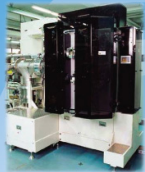
Photo of Advanced Coating System This equipment can continuously perform plasma treatment process and PVD coating.

Coating Film •TiN •TiCN •TiAlN •CrN •DLC •Others